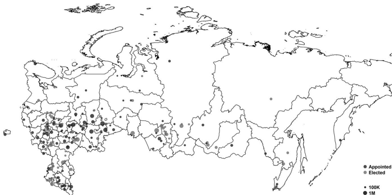
Figure 1. Geographic variation in the distribution of appointed mayors, 2003–12

popular elected governors with colorless bureaucrats who had a difficult time mobilizing votes for the ruling party.